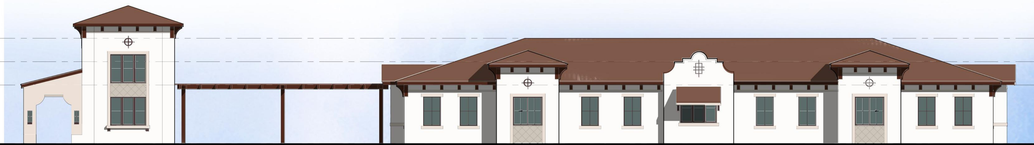
1. ELEVATION 1 1/8" = 1'-0"

TOP OF THE ROOF ELEV. +18' - 0" MEDIAN ROOF ELEV. +14' - 0" TOP OF BEAM ELEV. +10' - 0" GROUND LEVEL ELEV. +0' - 0"