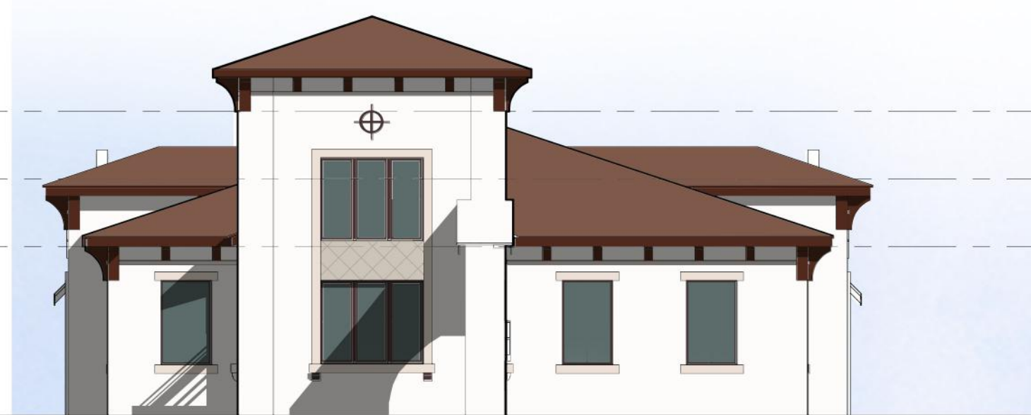
3. ELEVATION 3 1/8" = 1'-0"

TOP OF THE ROOF ELEV. +18' - 0" MEDIAN ROOF ELEV. +14' - 0" TOP OF BEAM ELEV. +10' - 0" GROUND LEVEL ELEV. +0' - 0"