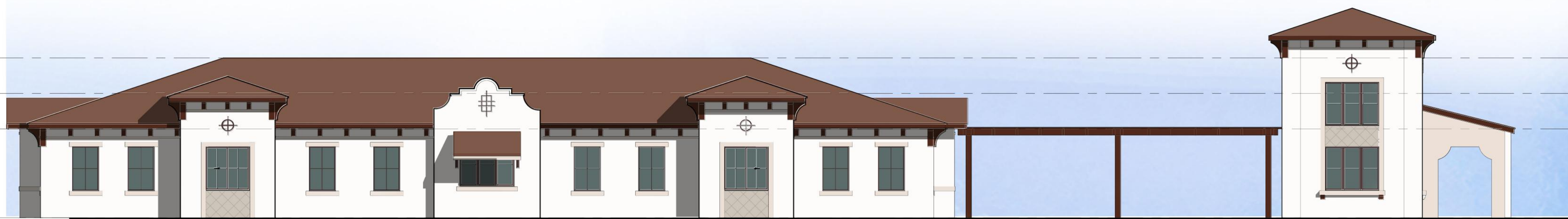
2. ELEVATION 2 1/8" = 1'-0"

TOP OF THE ROOF ELEV. +18' - 0" MEDIAN ROOF ELEV. +14' - 0" TOP OF BEAM ELEV. +10' - 0" GROUND LEVEL ELEV. +0' - 0"