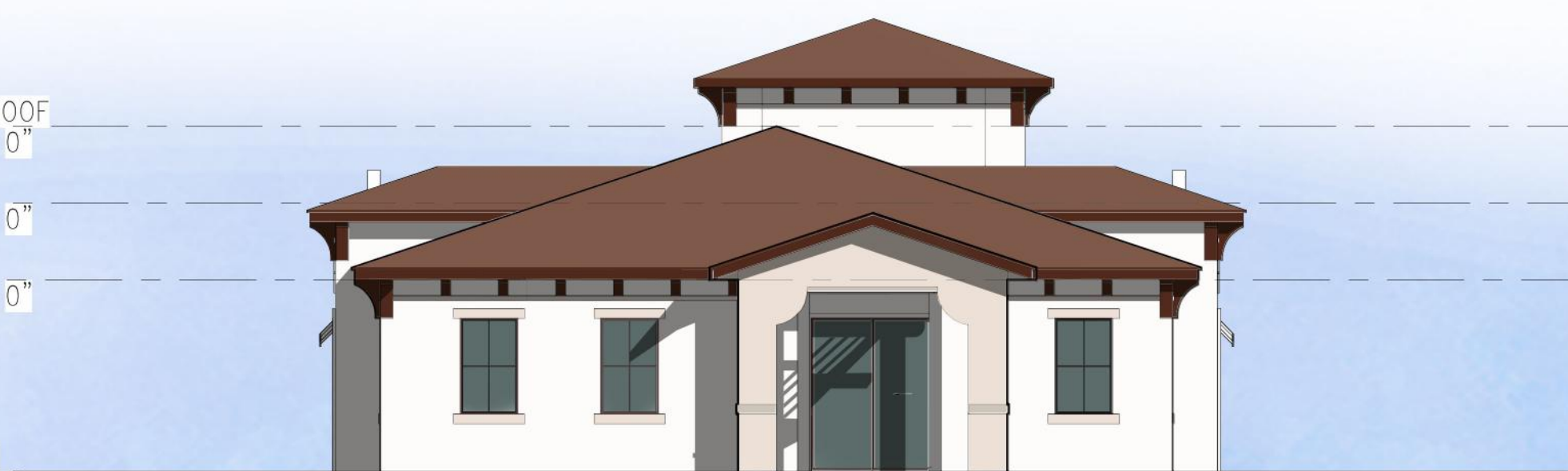
4. ELEVATION 4 1/8" = 1'-0"

TOP OF THE ROOF ELEV. +18' - 0" MEDIAN ROOF ELEV. +14' - 0" TOP OF BEAM ELEV. +10' - 0" GROUND LEVEL ELEV. +0' - 0"